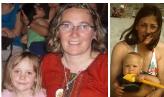
Mothers and children with a family balanced translocation

When your children begin considering their reproduction options, they will be essentially in the same position as you were: they can have children with ordinary chromosomes; children with the same balanced translocation as themselves; fertility problems or pregnancies in which the baby has unbalanced chromosomes.