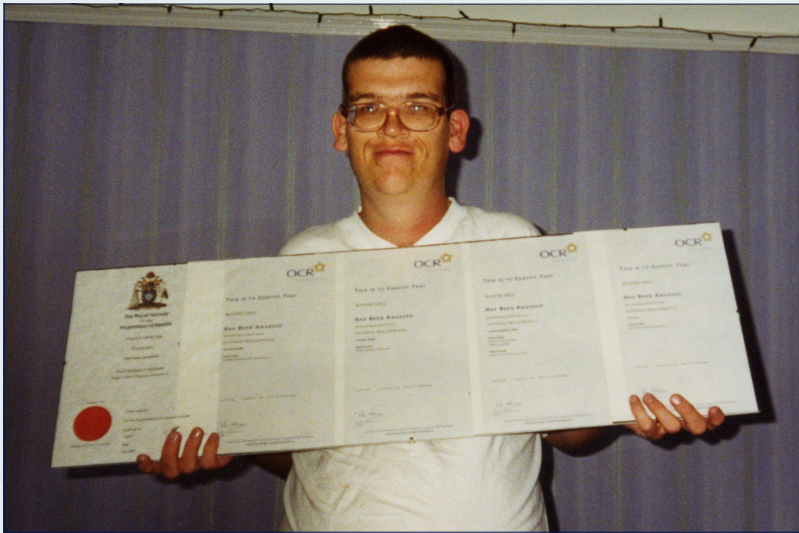
Certificates of achievement

Outcomes are very dependent on the intervention received and the timing of the intervention. Boys who have received early intervention and appropriate medical treatment have generally done better in their language development and their social development than boys who have a late diagnosis or who do not receive the appropriate hormonal and psycho-pharmacological treatments.