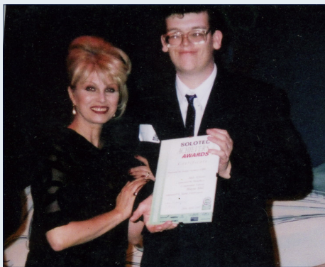
With Joanna Lumley

The best schooling for your son depends on his abilities and what is on offer locally. Many boys start their education in mainstream (regular) schools, and profit from one to one support being available when needed. They may need to be withdrawn for language activities. As the curriculum becomes more demanding, most boys transfer to a special education setting where their individual needs can be met better. In the Unique series, out of 13 families with a son in secondary education or beyond, four were in mainstream schooling, usually with a dedicated resource teacher. All other boys were at a special school or an attached learning centre. The XXY Project is currently developing a model individual education plan for XYY.