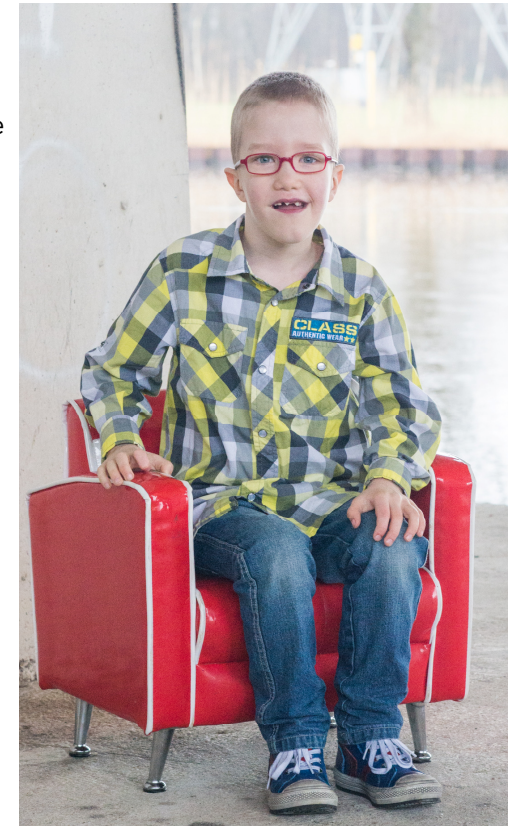
6½ years old

With the increasing use of the latest ‘gene sequencing’ technology, it is expected that many more people will be diagnosed with MED12 related disorders over the next few years.