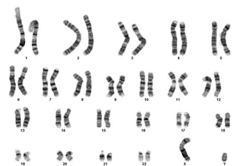
Chromosomes pairs 1-22, X and Y (male)

Chromosome pairs are numbered 1 to 22 and the 23 rd pair comprises the sex chromosomes, which determine biological sex (whether we are male or female). Females usually have two X chromosomes (XX) and males usually have an X and a Y chromosome (XY).