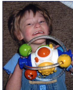
At 4.5 years

“After a completely normal pregnancy, she had breathing difficulties at birth and was taken to the neonatal intensive care unit. The breathing difficulties were partly caused by her receding lower jaw which with her weak sucking also meant that she couldn't breastfeed. But she took expressed breast milk from a bottle and then soy formula. By the age of 4, she was drinking on her own from a cup and although very petite, was growing well. Clinically, she has a seizure disorder that is only reasonably controlled on medication. At birth a small hole was found between the lower chambers of the heart, but this closed spontaneously. She also wears hearing aids as she has a hearing loss in both ears. In terms of development, she started to walk when she was three and at four years old, walks short distances before choosing to crawl instead. Her gait is more unsteady when she is unwell; for distances, she uses a wheelchair. She can feed herself with her fingers and is learning to use a spoon. She has a wide repertoire of means of communication, including gestures, facial expressions and vocalisations and understands her own name. In terms of behaviour, she enjoys social interaction and likes to laugh and be with people she knows ” - age 4