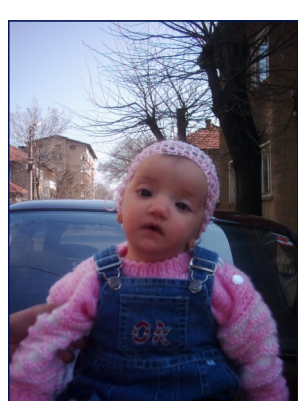
18 months old, with a 13q21.2 deletion

"She goes to Rainbows with 1:1 support. She likes music, TV, playing with mirror chimes and noisy toys and playing with other people