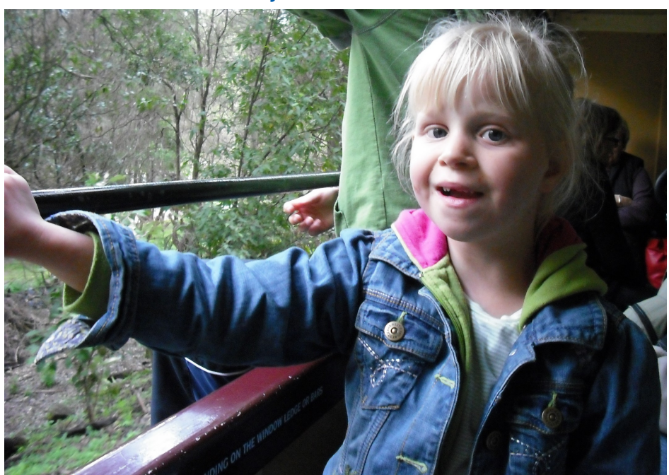
Seven years old