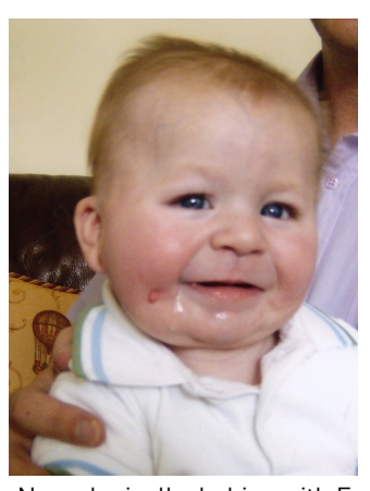
Seven months old

The doctors in the nursery may notice features in the baby that suggest a possible problem with fetal development - they refer to these as 'dysmorphic features'. Examples of dysmorphic features common in babies with Emanuel syndrome are deep-set eyes, low-set and malformed ears, ear pits or tags, a long upper lip (philtrum), a small chin (micrognathia) and excess skin at the back of the neck. Other things they might notice when examining a newborn with Emanuel syndrome are dislocatable hips, undescended testicles, inguinal hernia(s) (in the groin) and/or a small penis in boys, or a dimple in the skin just above the buttocks (called a sacral dimple). These features may prompt the doctors to order a chromosome test, which reveals the diagnosis.