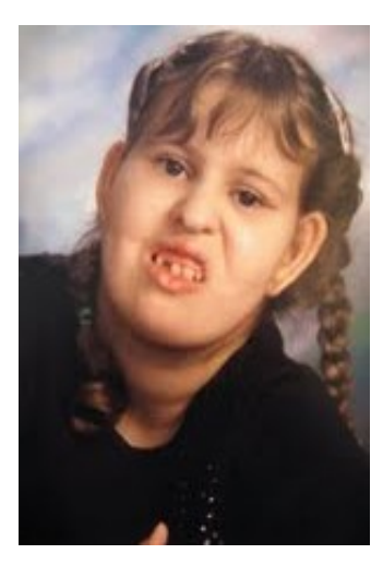
Twelve years old

A recent study (Carter 2009, see page 11) was published in which the researchers surveyed parents of 63 individuals with Emanuel syndrome.