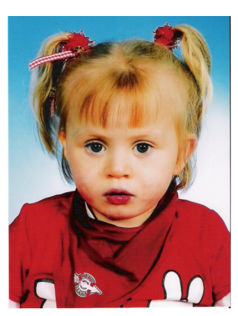
Four years old

Neurologically, babies with Emanuel syndrome are 'floppy' or hypotonic, which results from the inability of the brain to properly control muscle tone. Hypotonic infants can run into problems with breathing and feeding during the first few months of life. Breathing usually improves, but feeding can remain an issue due to poor motor coordination. The brain doesn't grow well in individuals with Emanuel syndrome, so the head is usually smaller than expected for age (microcephaly). Other differences in the formation of the brain are possible. The most serious is hydrocephalus, which is reported in about 10 per cent of cases. Hydrocephalus is an abnormal increase in the amount of the natural cerebrospinal fluid inside the ventricles of the brain.