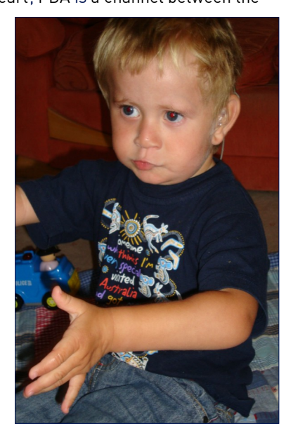
Three years old

He is happy, loving and generally healthy he has exceeded prognosis at diagnosis parent of 10-year-old