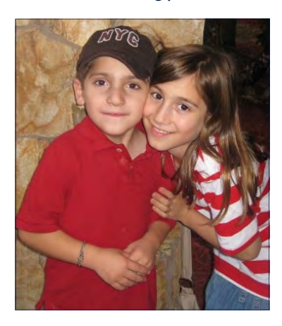
Five years, with older sister

The causes of chromosome disorders such as T9M are not yet fully understood but it is known that nothing you did before you were pregnant or during pregnancy could have