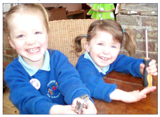
Three-year-old twins: (left) with typical chromosomes; (right) with trisomy 9 mosaicism

Most children known to Unique or who have been described in the medical literature have had some speech delay. Eventually, some children acquired enough speech or words to express their needs, but this was not possible for all. Typically, babies and children were sociable and this encouraged a rich variety of non-verbal communication. Babies usually communicated at first with smiles, vocal noises and gestures and progressed to using pictures, objects, touch-screens and a signing system before words emerged. In general understanding was better than their ability to respond with words.