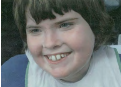
Often sickly babies usually grow to be healthy children