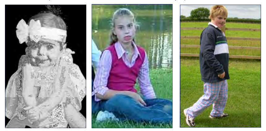
It's common to have a normal growth rate

Most babies are born a normal weight and size, sometimes with a head measurement that is small but may be in proportion to the body. Postnatally there can be a drop-off in growth rate, made worse in some cases by feeding difficulties and a heart condition. As a result, the curve on a growth chart can be in the lower bands for a child with a 9q34.3 deletion. Occasionally, stature may be exceptionally low, right at the bottom of the growth chart and at least one family has tried growth hormone to boost growth. However, among Unique members it is just as common to have a perfectly normal growth rate and become an adult of average height. There is a small group of children (four/19 within Unique ) who grow fast and are of above average height, at least until adolescence (Kleefstra 2006/1; Kleefstra 2009; Unique ).