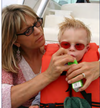
By school age some children are sitting at the table and feeding themselves