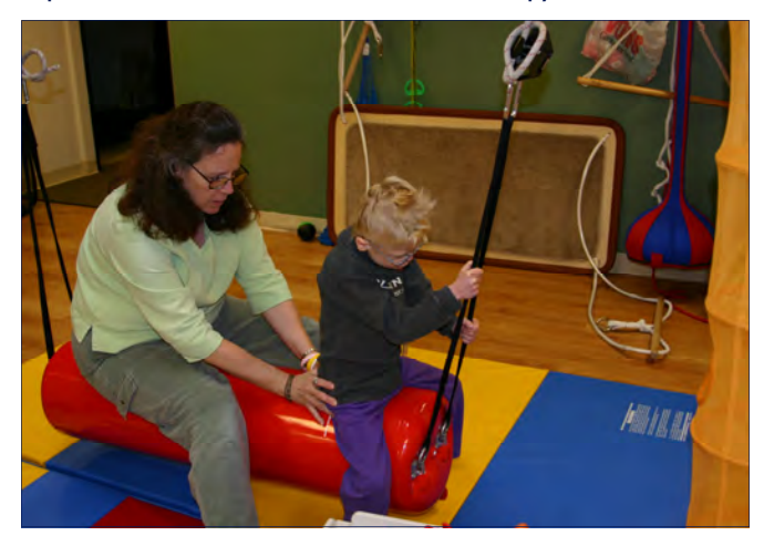
Children qualify for therapies

Families have additionally tried a wide range of therapies including music, hippotherapy (riding for the disabled), massage, relaxation, craniosacral, aromatherapy and water therapies – all with a measure of success. One family reported improvements after 12 weeks of Vital Stimulation therapy, a system that involves putting electrodes on the face and neck with the aim of stimulating and strengthening muscles. Another family reported great success with Applied Behavioral Analysis. One family reported marked improvements after ozone and urine therapy.