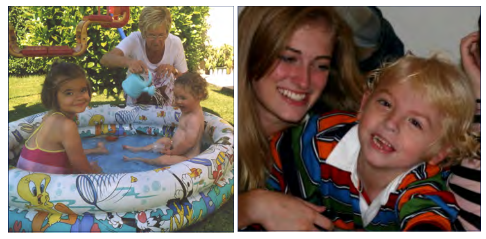
Young children are generally sociable