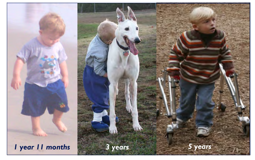
Children become mobile and learn to walk at very different ages

seating in safe surroundings. Children may become mobile, some by conventional crawling but others using ingenious alternatives including commando crawling (creeping), bottom shuffling (scooting) or continuous rolling as early as 12 months, but this is not possible for all. First supported or unsupported steps may be possible in a few children as early as 18 months but usually emerge later, most typically between 3 and 7 years, and may follow years of persistent practice. Some children need supports or insoles and especially supportive footwear to steady their loose joints and benefit from practice with a walker. Some children have flat feet and many have a slightly unusual style of walking and remain liable to trip and fall for many years. Those who have had a club foot corrected may also have an awkward walking style (Kleefstra 2009).