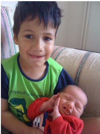
A 5-year-old boy with T8M and his baby sister who has normal chromosomes

T8M is held to be a chance event that typically carries a very low recurrence risk for the individual's parents and family. Unlike other conditions involving non-disjunction, like Down syndrome, T8M is not linked with a mother's or father's age at conception.