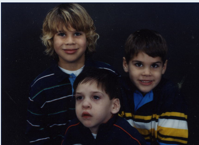
Brothers aged 6, 4 and 3, the three-year-old with a duplication from 8q12.2 to q22.1.

“He has no speech, normal hearing and understands everything, easily following simple and two-part commands and responding appropriately to information. Since the age of 6, he has used a communication device with an electronically generated voice output and sign language modified due to his limited fine motor skills. These have greatly reduced his frustration and given him a better quality of life - age 15, Recombinant 8 syndrome.