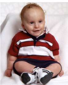
At 12 months. This little boy has an 8q24.2 duplication, with a small deletion of 9p.