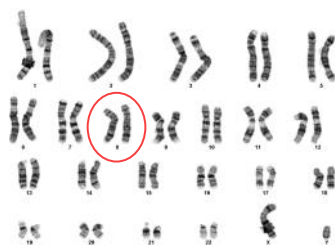
Chromosome pairs 1-22, X and Y (male)

A normal cell in the body has 46 chromosomes. Of the 46 chromosomes, two are a pair of sex chromosomes: two Xs for a girl and an X and a Y for a boy. The remaining 44 chromosomes are grouped into 22 pairs and are numbered 1 to 22, approximately from largest to smallest.