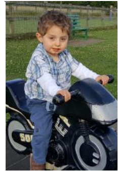
2 yrs 5 mths

“ She could roll and sit by herself at 9 months, and took her first steps at 21 months. She never liked to crawl. After a lot of professional training she could get up from the floor by herself when she was four-years-old. Now she can go hiking, including in mountain terrain. She can also run, but her running style is not perfect. She is very strong. ” - inv dup del 8p (p11), 9 years