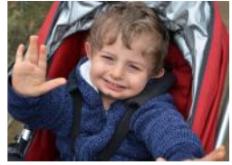
2 yrs 8 mths

mixed with some very nice sentences at times and is beginning to hold a conversation with another person rather than just giving information about himself. I feel that he takes in a lot of information and understands the world around him but has profound difficulty expressing what he knows.” - inv dup del 8p (p12), 13 years