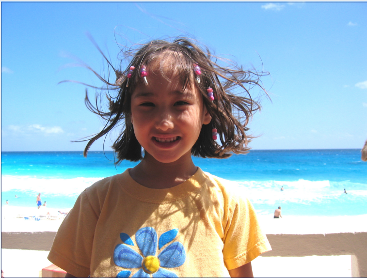
6 years old, 7q36.1-36.3 deletion

In some cases the check reveals a structural rearrangement of the parents' own chromosomes, but one that is balanced so that all the chromosome material is present, and the parents are then almost always entirely healthy. Occasionally the rearrangement will be the same as in the child, and again the parent may be healthy.