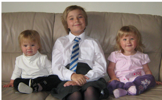
Right, at 2 years, with big and little sisters

As for development, one child with a small duplication of around 500kb in the 7q31.33 band only showed significant delay in speech and language: her parents were more convinced of her delay than her paediatrician was. This family