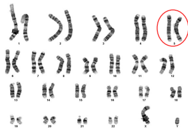
Chromosome pairs 1-22, X and Y (male). Chromosome 5 pair circled in red

Each chromosome has a short ( p ) arm and a long ( q ) arm. The bands are numbered outwards starting from the point where the short and long arms meet (the centromere ) (marked in yellow). A low number such as q11 is close to the centromere; this part of the arm that is fairly close to the centromere is called the proximal part. A higher number such as q33 is closer to the end of the chromosome, in the part referred to as distal . The term cen is used to indicate a location that is very close to the centromere, while ter (for terminal) indicates a location that is very close to the end of the p or q arm.