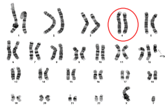
Chromosome pairs 1-22

When a particular set of developmental features occurs in a recognisable and consistent pattern as a result of a single cause, the condition is called a syndrome, and this is the case for WHS.