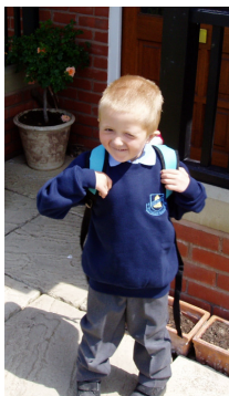
First day at school

Unique is a charity without government funding, existing entirely on donations and grants. If you can, please make a donation via our website at www.rarechromo.org Please help us to help you!